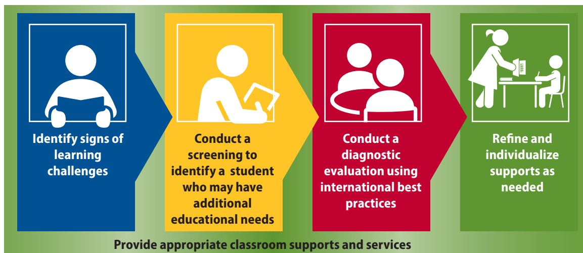
Figure 2. Steps to Identify Additional Learning Needs

Identifying a student with a learning disability is a complex and multifaceted process. Unfortunately, many schools and ministries of education have tried to simplify the process, to the detriment of students. When done appropriately, screening and evaluation processes can help identify students who may need additional educational supports to reach their full academic potential. Conversely, when the screening and evaluation of learning disabilities are conducted in a rushed, haphazard manner, or without using international best practices, harmful outcomes can result, such as incorrectly identifying students without disabilities as having learning disabilities, or improperly identifying students who may have learning disabilities. This section of the guide introduces typical signs of learning disabilities, the screening process to identify students with learning needs, and then the steps needed to effectively evaluate a student for a specific disability. This guide focuses on screening and evaluating children in the classroom (typically primary and secondary schools) versus early identification process or other non-classroom-related identification processes. This process can be simplified into the following steps in Figure 2.